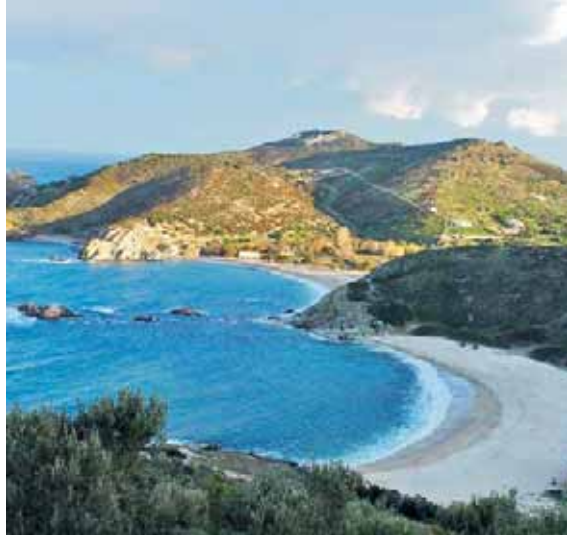
Buffalo, Aghios Dimitrios, Stomio and Heiromili.