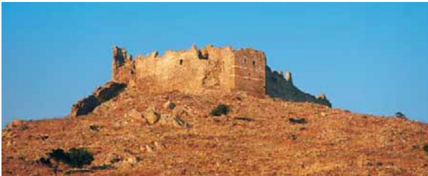
Castello Rosso

Important agro-tourism units operate in the region.