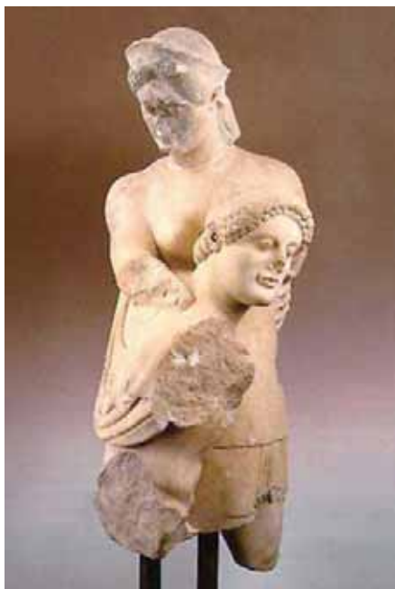
Sculpture complex showing Theseus and Antiope from the Temple of Apollo Eretria Museum

The first building phases on the ancient theatre and the Tholos , a circular building in the city's ancient agora, date back to the 5 th century BC. Eretria seceded from the Athenian Confederacy to which it belonged in 411 BC, forming an alliance with other cities in Evia, the Koinon ton Euboeon . The city's prosperity in the 4 th and 3 rd centuries BC is reflected in its monuments. The house of mosaics is the