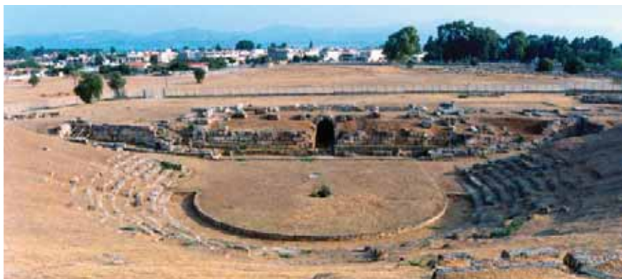
Amphitheatre from the Hellenistic Era and stage from the Roman Era

major remnant from this period. After 338 BC the city came under the influence of Phillip II of Macedon . From 295 to 268 BC, Menedemos , the Cynic philosopher, founder of the Eretrian school of philosophy, and teacher to Antigonos Gonatas , ruled the city, which was destroyed by the Romans in 198 BC.