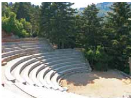
The Theatre at Setta