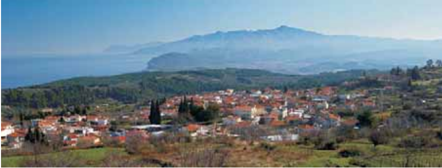
Aghia Anna

familiar with old customs and the way local inhabitants lived until recently.