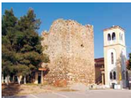
The Venetian Tower at Gymno