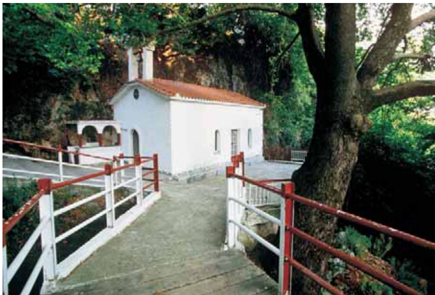
Agia Kyriaki, in Kambia