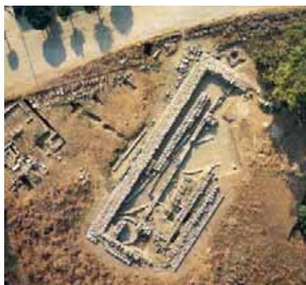
Temple of Apollo Daphnephoros

The Archaeological Museum of Eretria , near the archaeological site of the ancient city contains finds from the excavations in the town, as well as from digs at Lefkanti and Amarynthos .