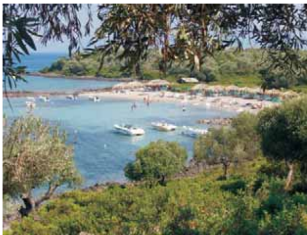
The beach at Monolia

According to local mythology, the peninsula is part of the body of Lichas , who was slain by Heracles, while his head formed the Lichadonisia islands.