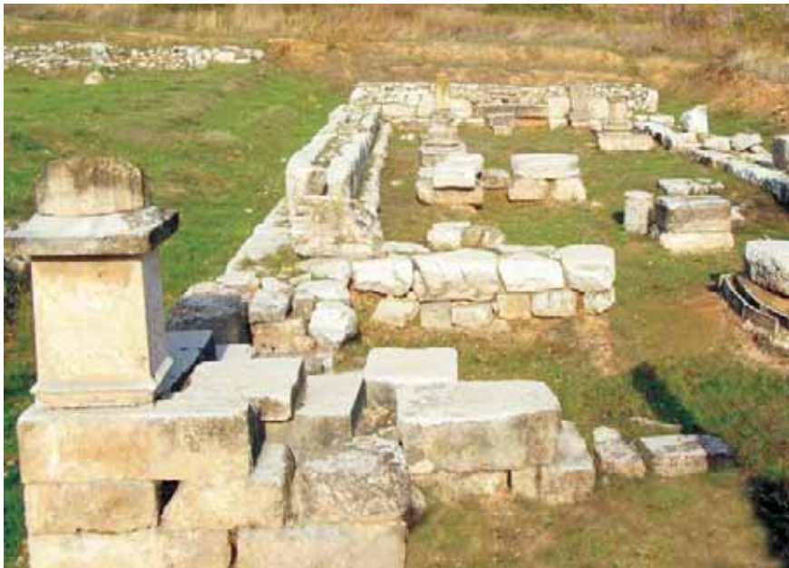
Temple of Artemis Aulideios

Easy road access to Athens, Chalkida and Thebes make the area ideal for recreation and entertainment, particularly during the summer, due to its natural beauty, extended and amazing beaches and deep crystal clear seas. The area's image benefits from picturesque taverns, local ouzeri and mainly from the well-developed nightlife, particularly along the renowned Alykes beach.