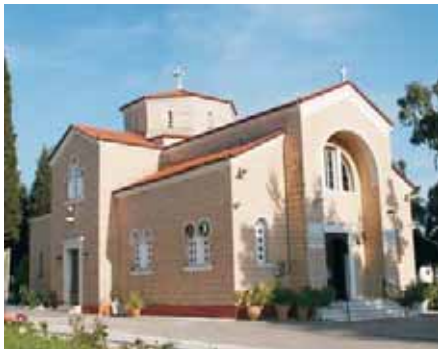
Panagia Faneromeni in Nea Artaki