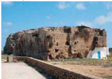
Agios Nikolaos, Pouria-Skyros