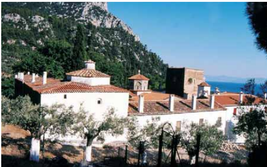
The Monastery of Agios Nikolaos Galatakis

There are monasteries, monuments of Greek Orthodoxy, all over Evia, which are an integral part of our national heritage and a major tourist attraction, thrilling to all fans of religious tourism.