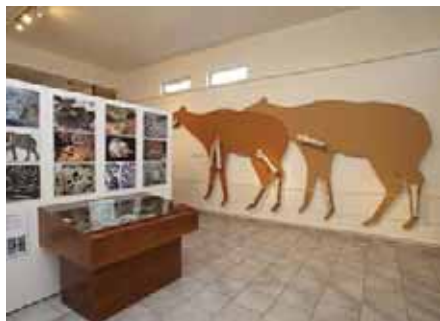
The Kerasia Museum of Fossilised Mammals