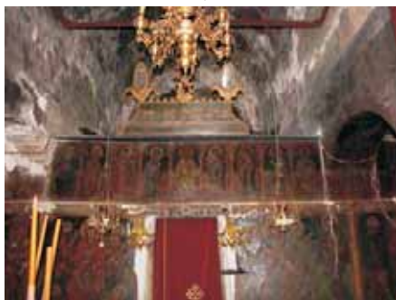
Monastery of Panagia Perivleptou Politikon