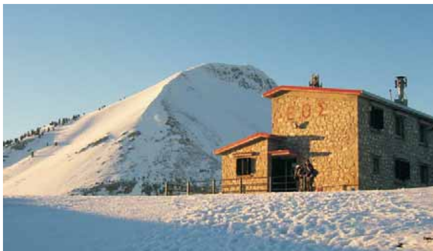
Mountaineering Refuge of Dirfy "Michalis Nikolaou"

For extra adventure, look no further! Evia offers an extensive network of signposted hiking trails, most of them relatively easy. There are also quite a few uncharted areas, where steep paths through the forest succeed beautiful plateaus, and mountain tops with views that take your breath away. The Mountaineering Refuge of Dirfy MICHALIS NIKOLAOU (altitude: 1,100 m) is on Mount Dirfy, past Steni, on a pass with astounding views of both the Aegean and the Euboikos Gulf, and it can accommodate a minimum of 50 people, with all mod cons. The smaller and more basic Mountaineering Refuge of Ochi is located in the region of Karystos.