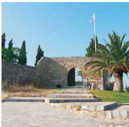
Kara-Baba Castle