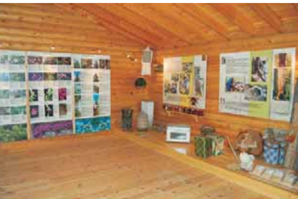
Museum of the Forest, at Prokopi

The area of Mount Kandili / the valley of Prokopi / the Delta of the Kireas River , a swathe which extends from the Northern Gulf of Evia to the Aegean, is of particular environmental interest and is listed in the NATURA 2000 Network (GR2420003). The region has a great variety of forested expanse, with deciduous as well as evergreen trees, with large numbers of local native plants most of which are quite rare as well as a variety of birds, particularly birds of prey.