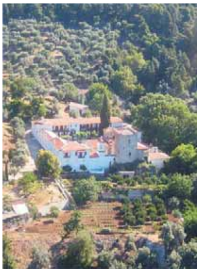
The Monastery of Agios Nikolaos Galatakis