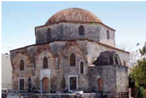
Emir Zade Mosque