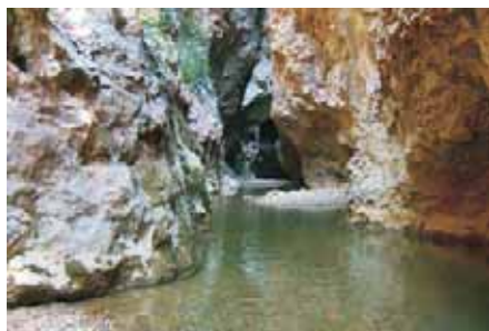
The Gorge of Nileas

Visitors should also visit the wonderful and endless beaches Agali (Aghia Anna) and Frangaki (Achladi).