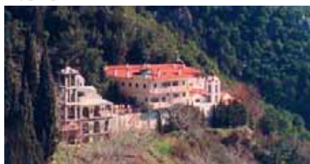
The Monastery of Aghios Georgios Elion

Plutarch describes the social life that had developed in the city, his pleasant and entertaining stay there, and makes reference to the excellent local diet, with plenty of fish and poultry. Strabo mentions the appearance of new springs and their healing properties.