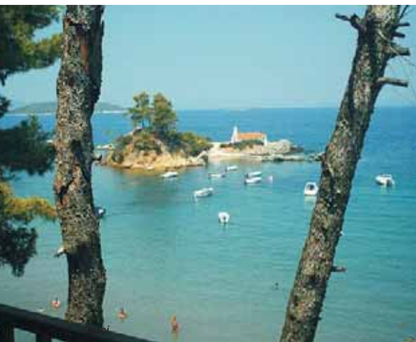
The beach at Ellinika

lovers can follow the gorge that starts up a short way out of the village, and is covered in plane trees, pines and walnut trees and leads to Agrilitsa . The view from here is magnificent, overlooking Pilio and the Sporades Islands .