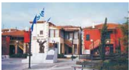
Folklore Museum of Psachna