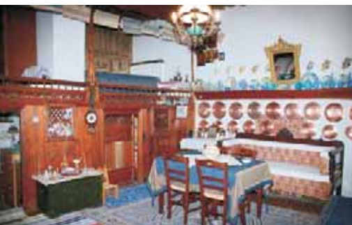
Traditional Skyrian house

The decorative motifs used in local folk