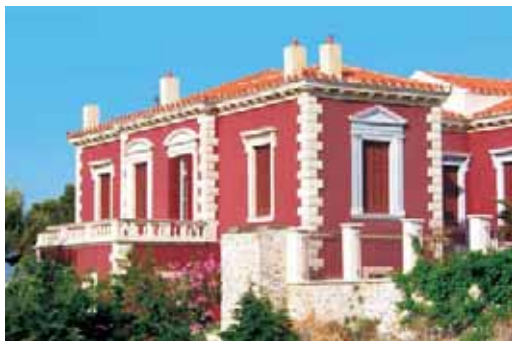
The Red House