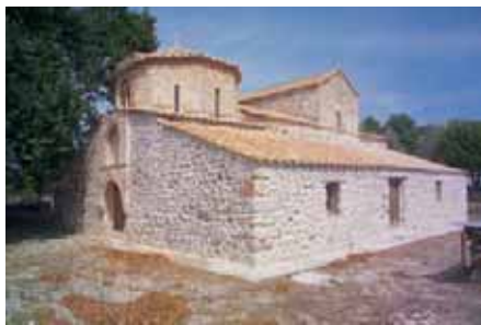
Agios Dimitrios of Avlonari