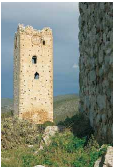
Venetian Towers at Lelantine