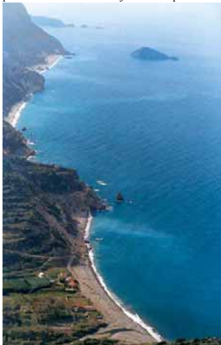
The beaches at Hiliadou and Metohi