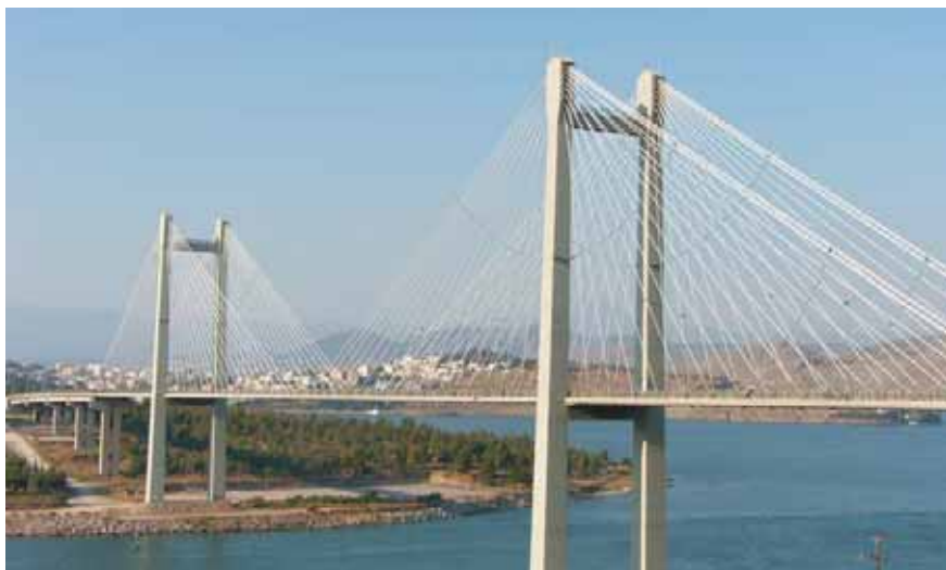
Chalkida - Bridge

Evia, the second largest island in Greece, is an ideal and excellent holiday destination for holidaymakers from both Greece and abroad.