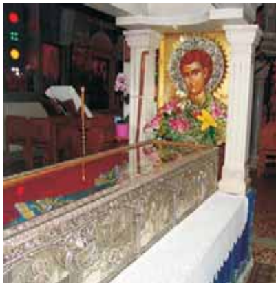
Church of Osios Ioannis the Russian