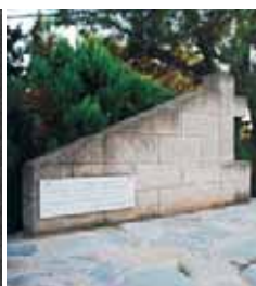
The Tomb of Yiannis Skarimbass