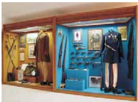
Anastasios Liaskos Historical-War Museum