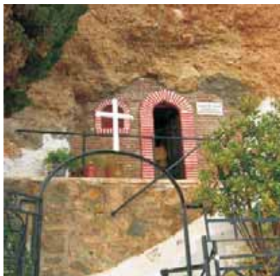
The cave of Agios Christodoulos in Limni