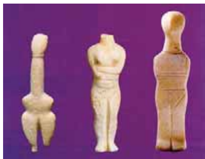
Cycladic idols or statuettes from Manika in the Archaeological Museum of Chalkis

Its important strategic position made it a target for the Athenians, starting from the mid sixth century BC. Chalkida participated in the Second Athenian Confederation, seceded in 446 BC, whereupon Pericles himself, at the head of the Athe-