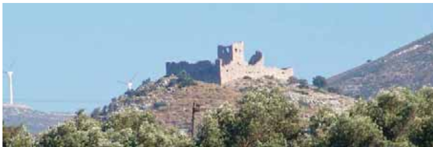
The Venetian Tower at Milaki

Continuing on past Amarynthos, you reach Aliveri (seat of the Municipality of Tamyneoe ). This is a modern town with strong economic development. The port for Aliveri is the picturesque Karavos , which draws people from the general area and beyond.