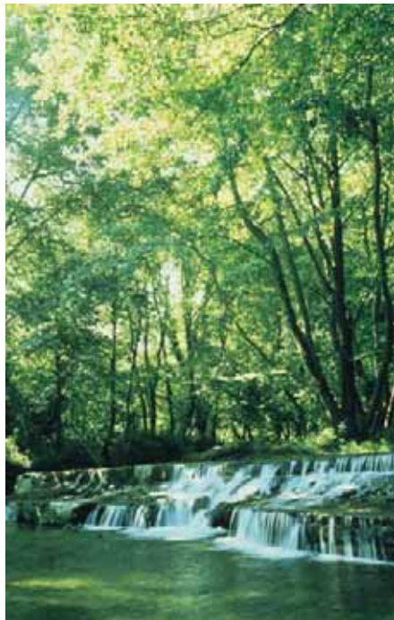
Plane Tree Forest Kirea

Greenery is rampant and the landscape is perfect for nature lovers and hikers. The beaches, too, are unique. Pili, Atalantos, Kymassi , and Krya Vryssi all reward even the most demanding visitors.