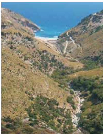
The gorge of Aghios Dimitrios

Marmari, including: Chryssi Ammos, Kokkini, Fygias, Kavoi, Zastani, Lykorema, Aghia Eirini, Baniera, Rossa, Vassiliko, Schoinodavli, Limnionas, Verelaioi, Kallianoi.