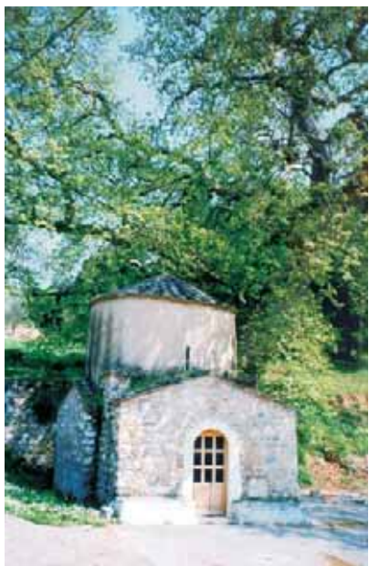
The Monastery of Ypapanti Erion in Katherous.