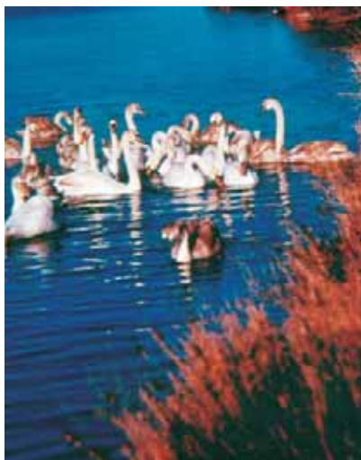
Swans at Megalo Livari

The area contains one of the few wetlands habitats in Eastern mainland Greece and as such has increased environmental interest. Mikro and Megalo Livari lagoons are important resting places for migratory and over-wintering birds. The largest population of otters lives here, and there are small expanses of alluvial and riverine forest, which have been designated Natural Monuments for Conservation . The complex of Mikro and Megalo Livari the Xiria Delta and the Deciduous Forest of Aghios