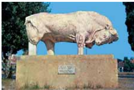
Marble Bull, Oreoi

Oreoi are a popular tourist destination. In the summer months, and during the winter weather permitting they are connected by boat to Trikeri and Volos .