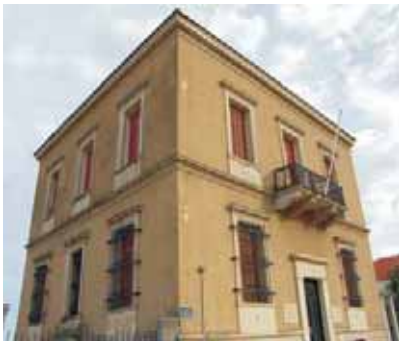
Folklore Museum of Kymi

The Mourteri and Manikiotiko Gorges , located in the general region of the Municipalities of Avlonas, Konistra and Kymi , are also Landscapes of Outstanding Natural Beauty (AT2011004)