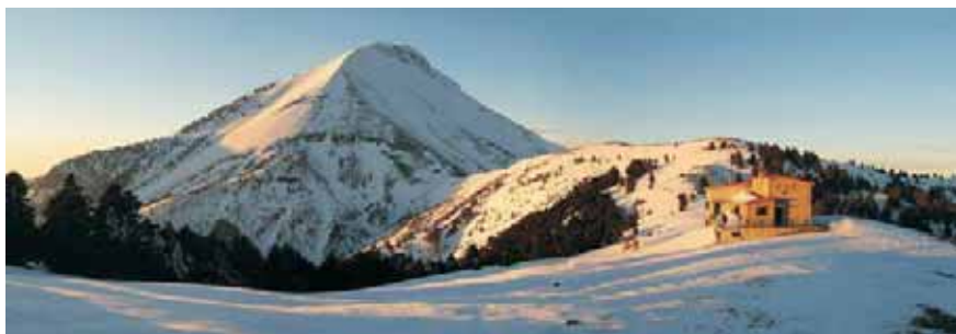
Mount Dirfy, Mountain Refuge

of 1,100 m. It takes almost two hours to climb from the Mountain Refuge to the peak (altitude 1,745m), while it takes three hours to hike from the Refuge to Xirovouni. For information about hiking, visitors can refer to the recent publication by the Prefectural Local Government " Monopatía tis Evias " ( The Footpaths of Evia ), or contact the Municipality of Dirfy and the Hellenic Alpine Club of Chalkida.