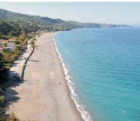
The Frangaki beach, Achladi