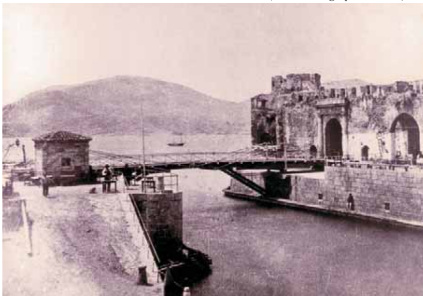
The Fortress of the Straits, shortly before being torn down at the end of the 19 th century

"...these are the men who drink the water of the sacred spring of Arethusa" (Strabo, Geographica, C449)