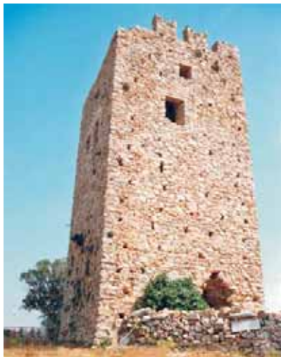
The Venetian Tower at Trachili