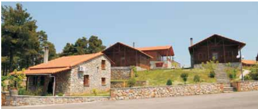
Forest Village, Papades Nileos

In Papades Nileos there is a newly built Forest Village . The huts are made of wood and stone, and surrounded by lawn, flowers, stone walls and pretty alleyways. The village is located in a forest of pine and oak trees.