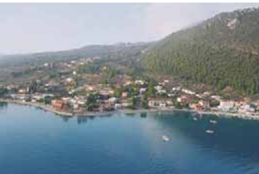
Aghios Georgios, Lichada