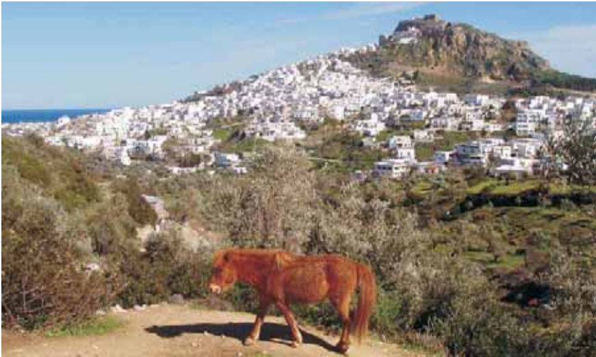
The town of Skyros (Chora)

The largest island of the Northern Sporades enchants with its varied landscapes: